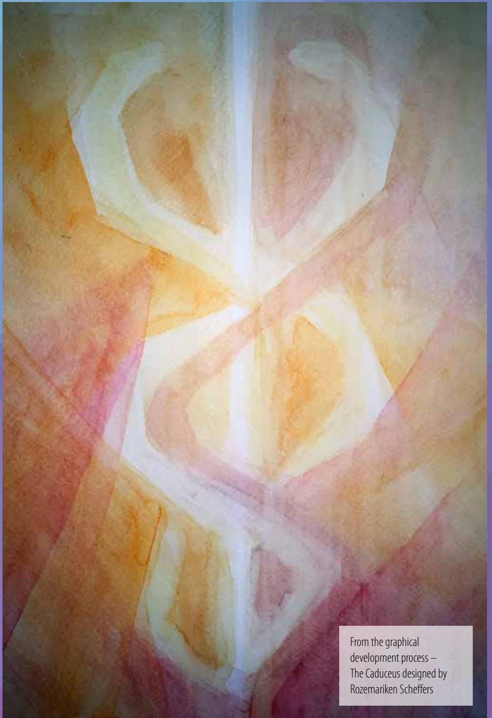
From the graphical development process – The Caduceus designed by Rozemarijken Scheffers